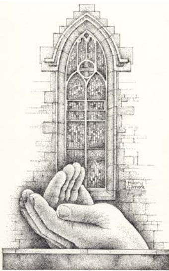
Confessions in Cathedral every Saturday: 12 to 1pm & also before and after 6.30pm Mass