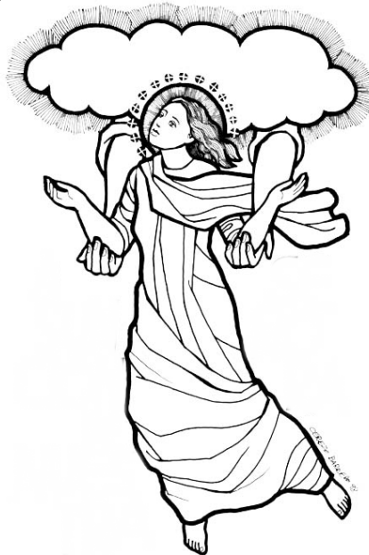
Pray for us

Life is a highway on which the years go by. Sometimes the road is level. Sometimes the hills are high. But as we travel onward to the future that's unknown, we can make each mile we travel a heavenly stepping stone.